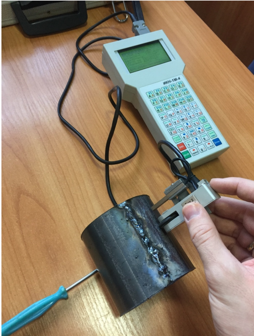
Fig. 1. General view of the TSC-1M-4 apparatus.

The graphs generated by the device describe with the help of lines the nature of the placement and the magnitude of residual stresses in the metal under study. The H_s line is a curve that describes the strength of the magnetic field of the workpiece, and by itself does not carry a complete picture of the stress concentration zones. Therefore, an additional characteristic is introduced that more accurately depicts the stress concentration zones – the gradient of the magnetic field of the workpiece.