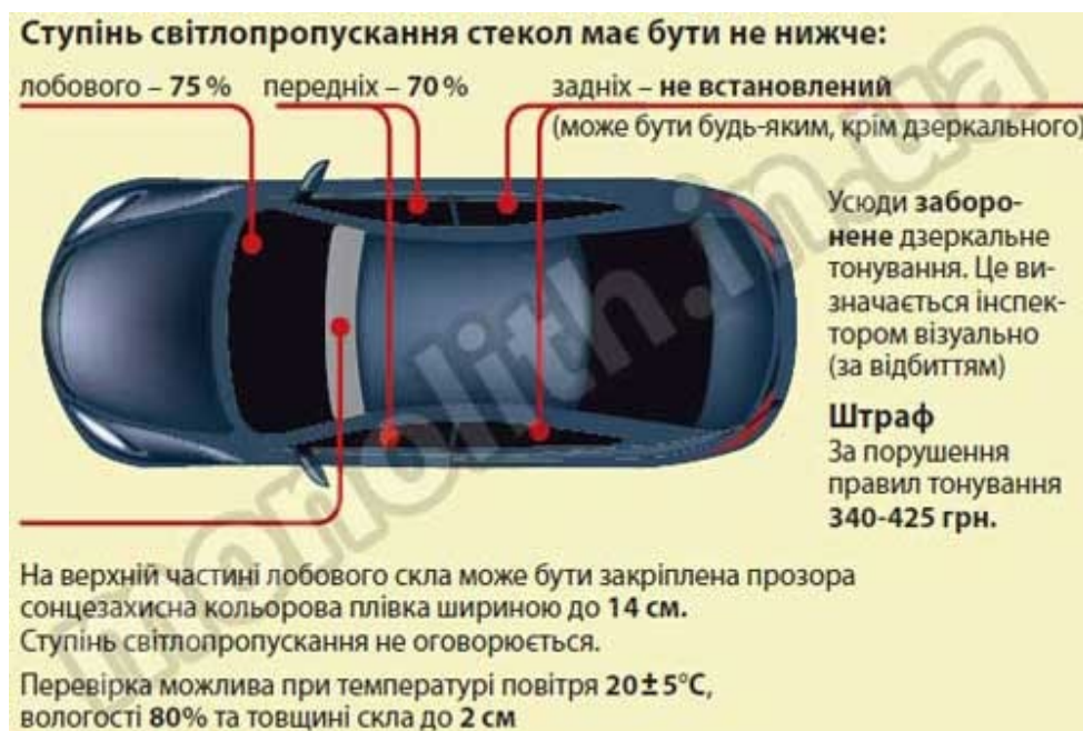
Fig. 1 - Permitted degree of light transmission